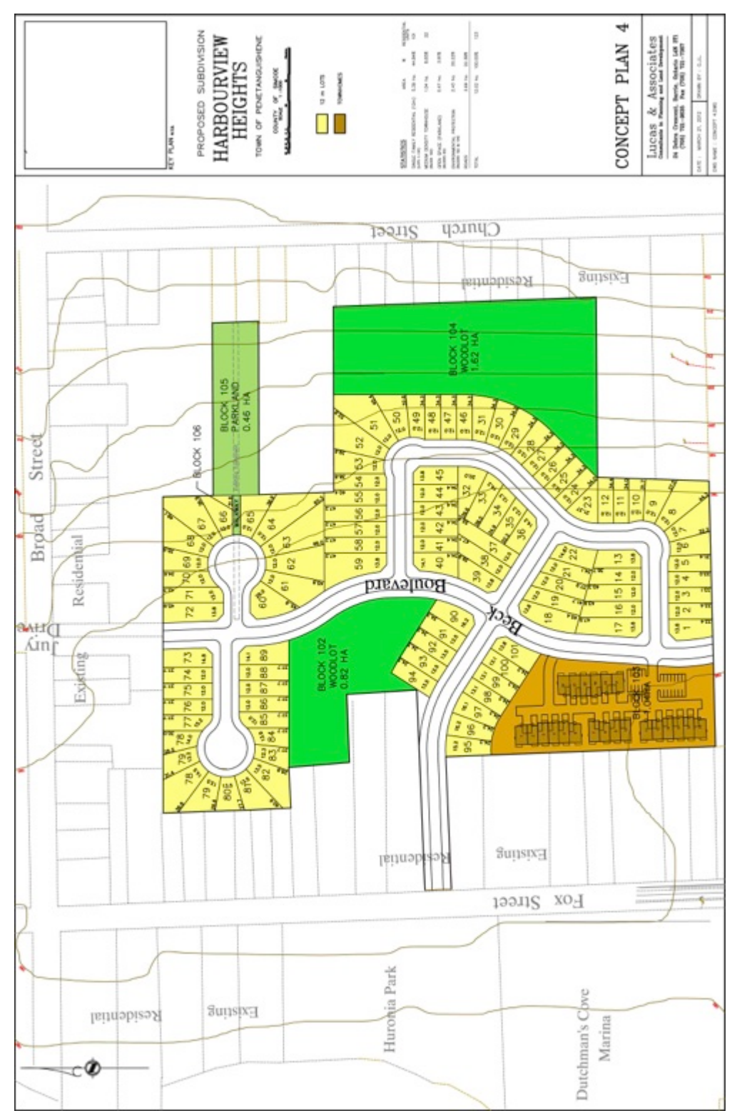
FIGURE 3 CONCEPT PLAN 4 (LUCAS & ASSOCIATES 2012)