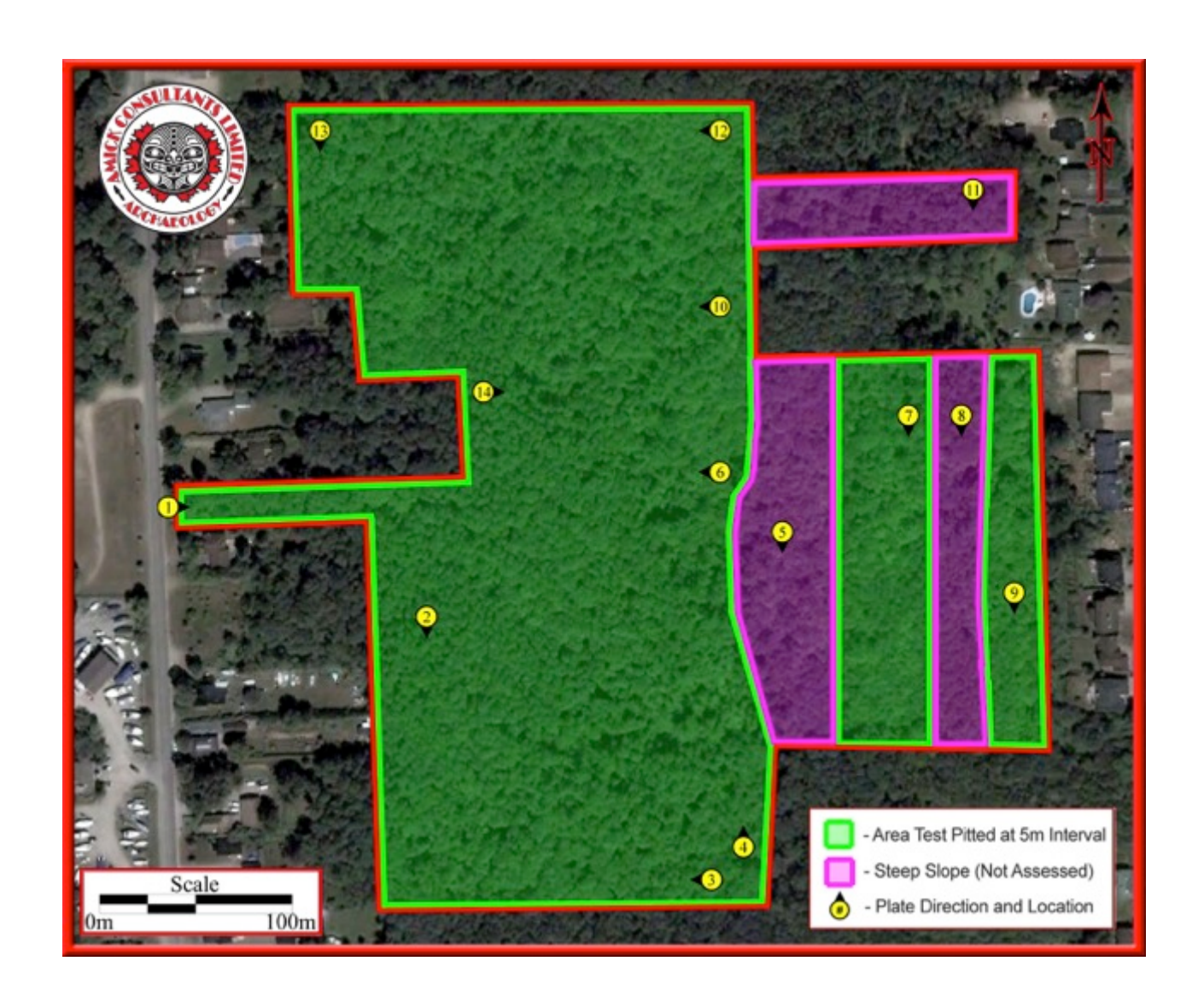
FIGURE 4 AERIAL PHOTO OF THE STUDY AREA (GOOGLE EARTH 2011)