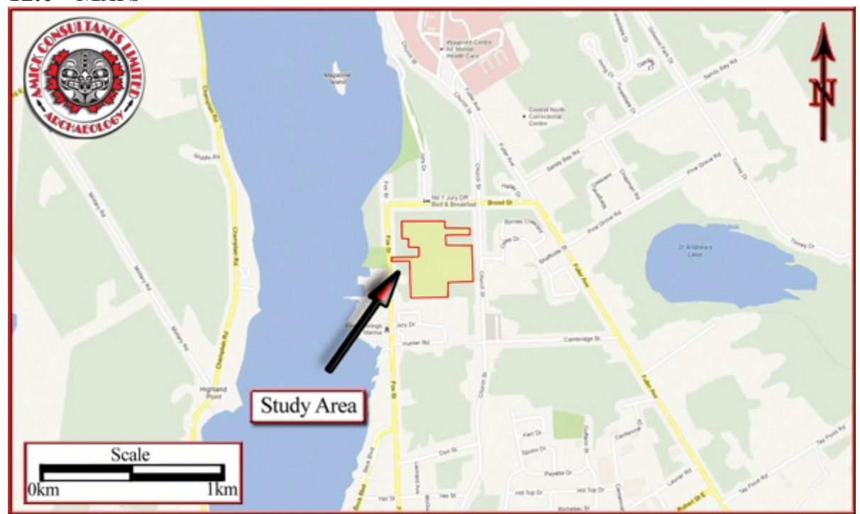
FIGURE 1 LOCATION OF THE STUDY AREA (GOOGLE MAPS 2012)